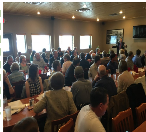
A full house at the Annual meeting

Have you seen any of the AgNM staff at recent events? When you do, please say hi, stop by the booth and maybe get a new cap or pocket knife!