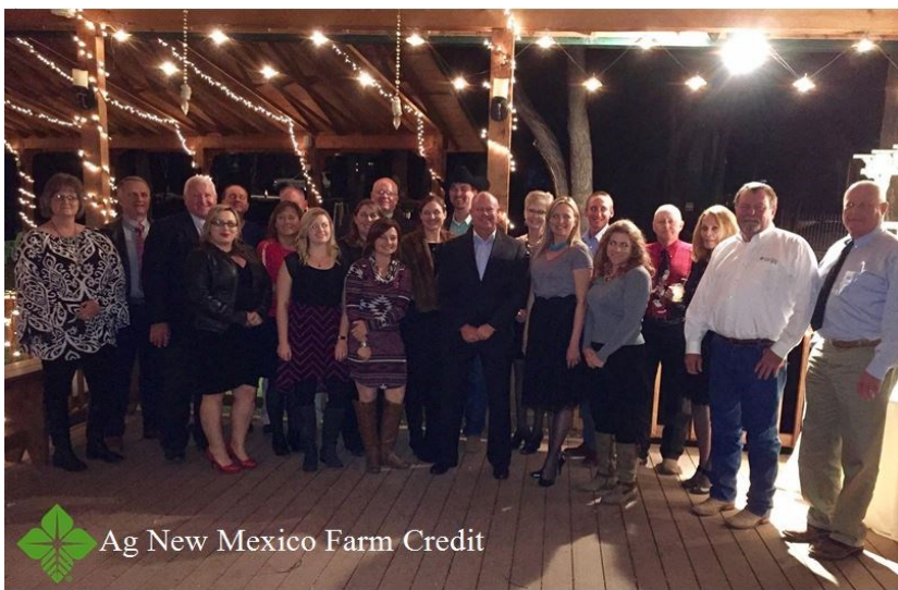
AgNM staff at the Christmas Party