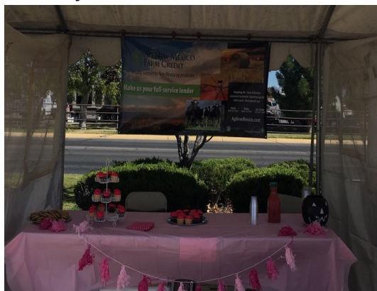
AgNM booth at NMSU/NMDA Ag Day

Have you seen any of the AgNM staff at recent events? When you do, please say hi, stop by the booth and maybe get a new cap or pocket knife!