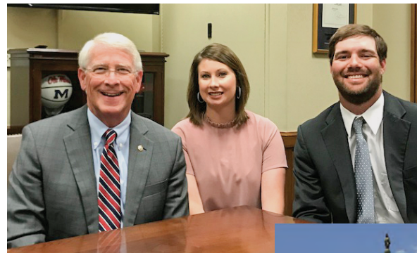
Above: While on Capitol Hill, the Christmases discussed policy issues with Sen. Roger Wicker. Right: The Christmases take the opportunity for a photo at the Capitol.