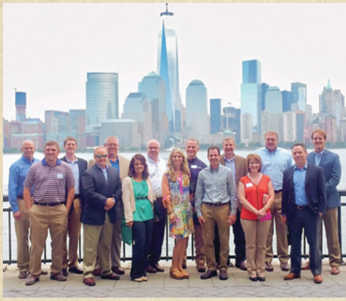
Farm Credit employees visited Washington, D.C., and New York City, in the background, during the Association Leadership Program in July.

A nually, the Farm Credit Bank of Texas (FCBT) hosts the Association Leadership Program, which takes Farm Credit employees to New York City and Washington, D.C., for four days.