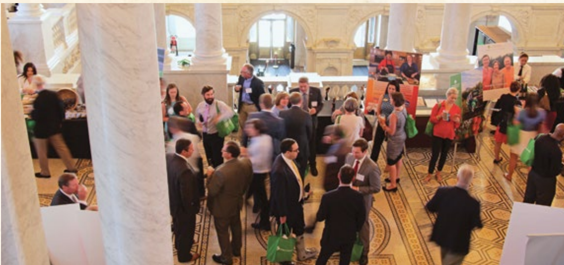
Farm Credit hosted government officials and Capitol Hill staff at the historic Library of Congress Great Hall, where attendees took home about 15,000 samples of products made by Farm Credit customers.