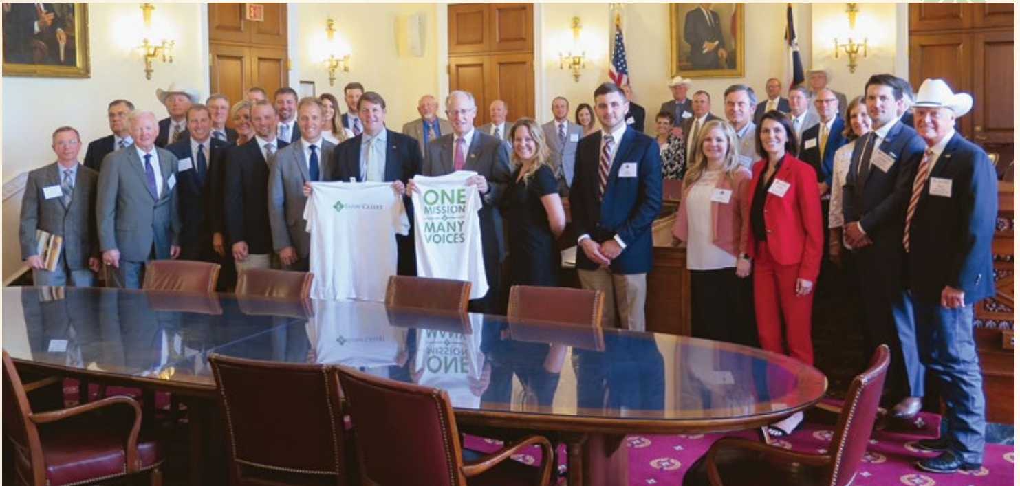
Holding Farm Credit shirts are U.S. Reps. Jodey Arrington, left, and Mike Conaway, right, who met with about 45 Farm Credit representatives from Central and West Texas on July 26. Conaway is chairman of the House Agriculture Committee.