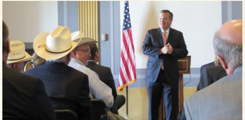
Sen. Ted Cruz, above, and Sen. John Cornyn met with about 70 Farm Credit representatives from across the state to discuss policies that are important to farmers, ranchers and rural residents.