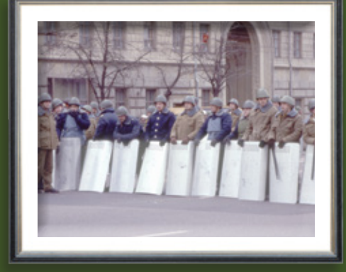
Scene from Russia trip